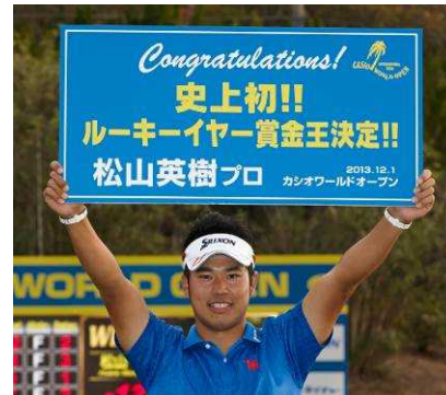
2013 Hideki Matsuyama